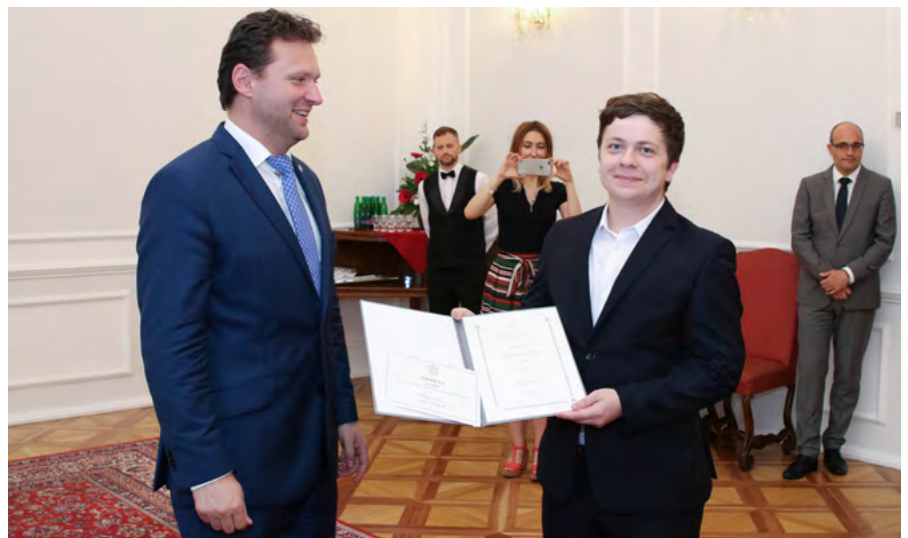
F. L. Rieger Prize awarded by Radek Vondráček (left), Chairman of Czech Chamber of Deputies